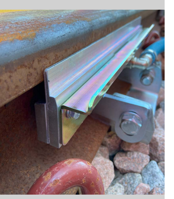
40cm Blade with Steel Thin Front Plate and Trough