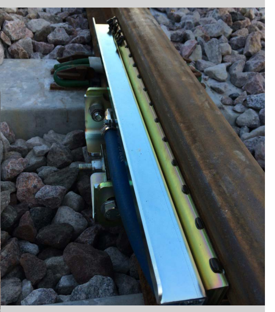
60cm Blade with Trough