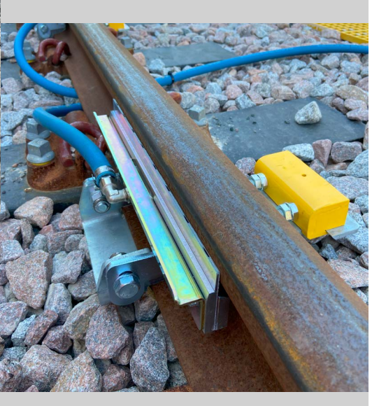
Low Clearance Blade and Back Clamp